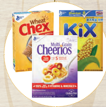
Low Sugar Breakfast Cereal