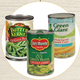
Low Sodium Green Beans and Corn

These 3 food categories are what we need this season!