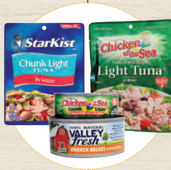
Canned Tuna and Chicken packed in water