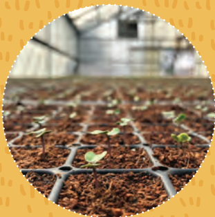
STAGE 1: INITIAL SEEDING