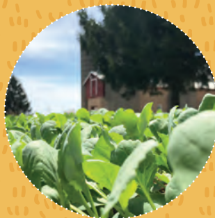
STAGE 2: SEED TO SEEDLING