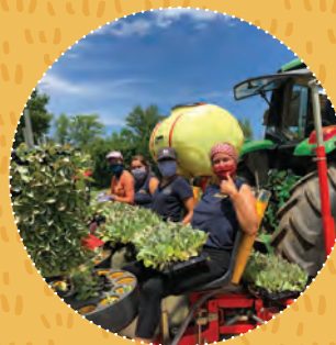
STAGE 3: TRANSPLANTING