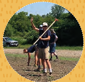
STAGE 4: CULTIVATION